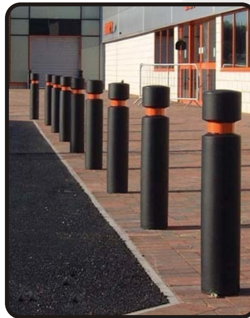
Reflective band Colour options